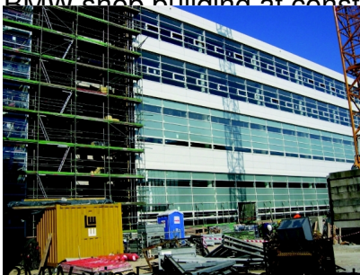
BMW shop building at construction site