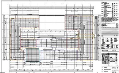
Typical horizontal section of a unit